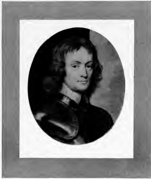
COLONEL LILBURNE (1618-1657) BY SAMUEL COOPER